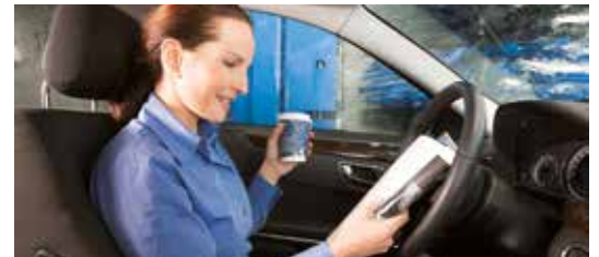
Customers can make use of the time or simply relax while the wash is in progress.

Your customers can remain comfortably seated in their cars, without the hassle of having to get out, wait in the open and get back in. This allows them, for example, to relax and enjoy the cup of coffee they have just bought from you. This enables you to win conveyor tunnel system customers for your gantry wash, who primarily want convenience and comfort.