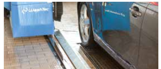
No risks of slipping or tripping due to wet bay and rails.

By remaining seated in their vehicles, there are no risks of slipping or tripping for your car wash customers. Features such as width monitoring and the horn sensor additionally enhance safety.